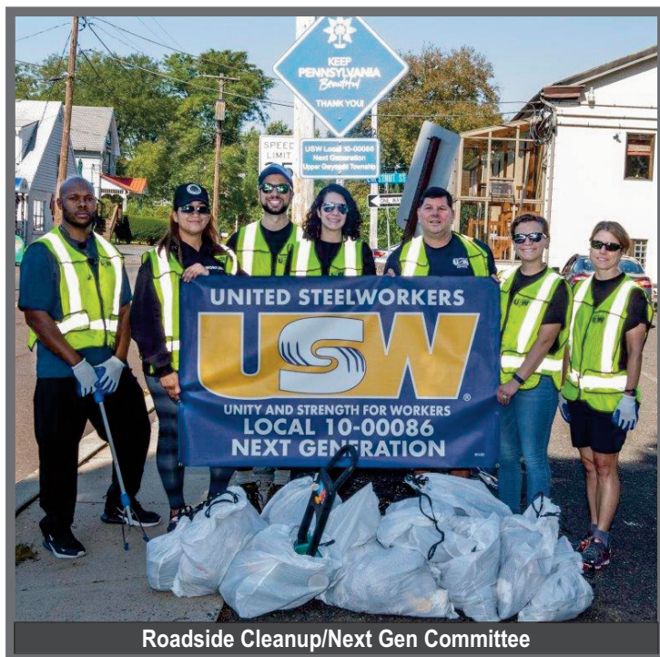
Roadside Cleanup/Next Gen Committee

• Regardless if you are a CAT Team member, a new hire or a venerable veteran eyeing retirement this is not the time for apathy. We have a contract ready to expire and a new one on the horizon. Speak up about what works in your department and what doesn't. Get engaged. It's your Job. It's your Future. It's your Union.